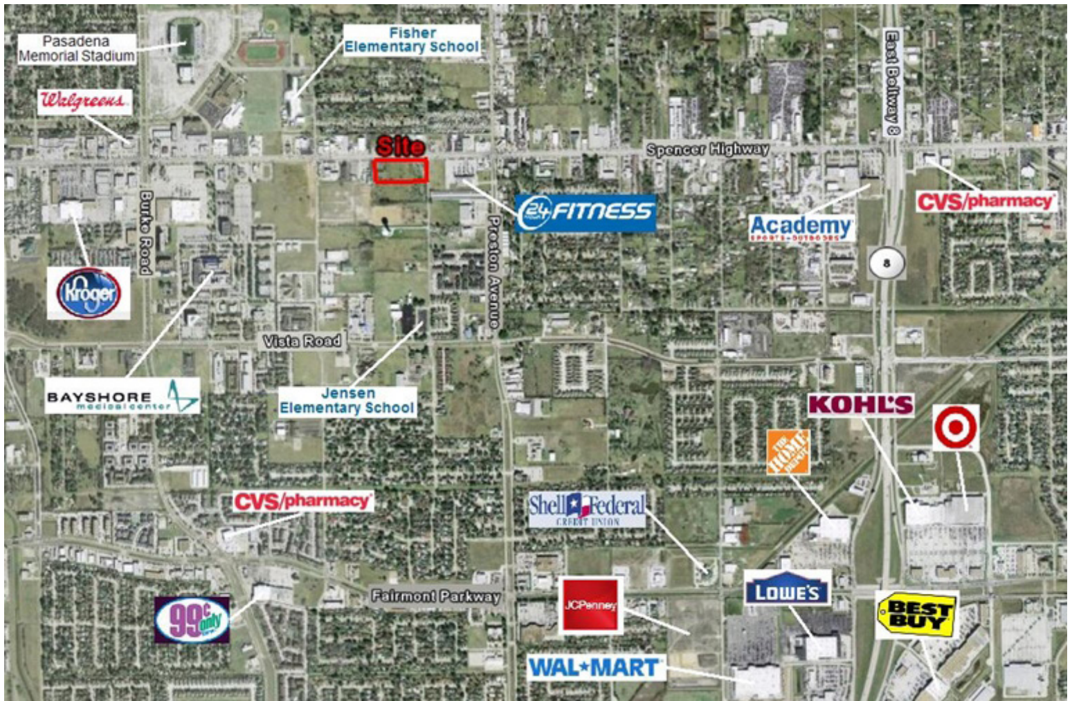
Proximity Aerial Map (above) | 4422 Spencer Hwy, Pasadena, TX 77505 | Location Map (below)